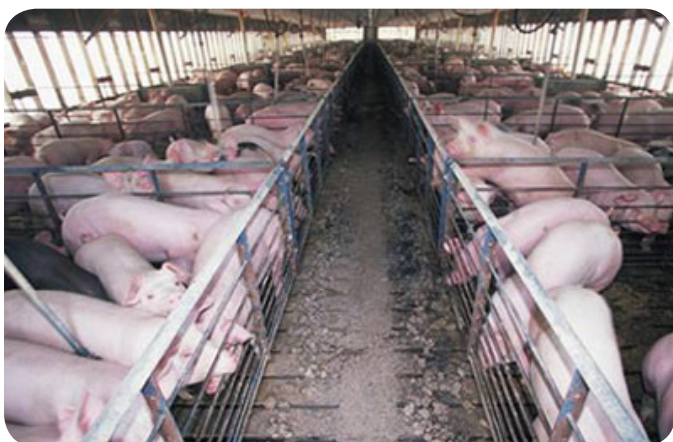
Pigs in a finishing facility

reason for leaving the herd. Sows and boars are culled from the herd due to old age, reproductive failure, poor performance (small litter size, high preweaning mortality, low birth weight), illness or injury. About one in five, to one in four, breeding age females are culled or die every year. Those that are culled are usually sold to livestock auctions or sent directly to slaughter.